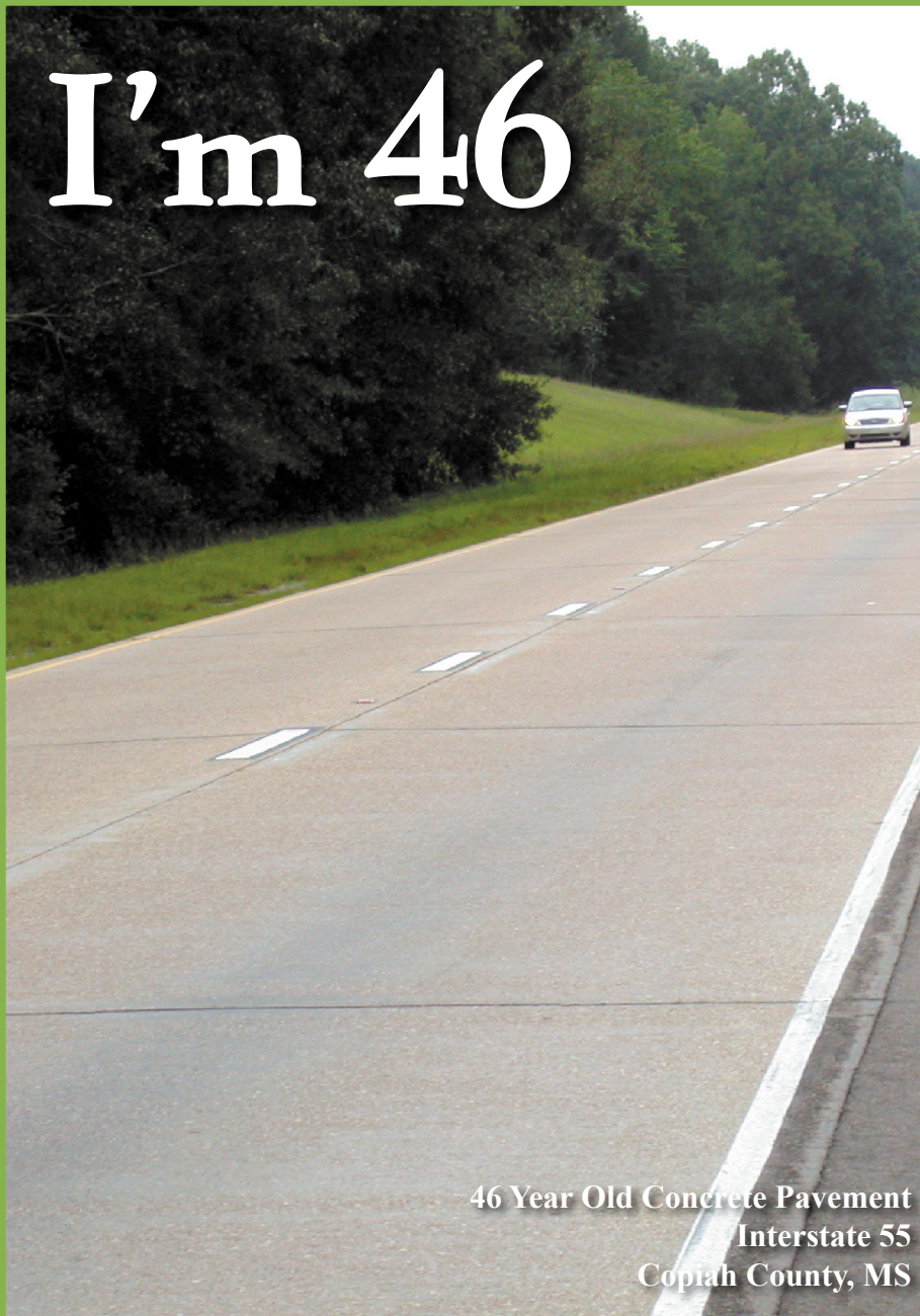
46 Year Old Concrete Pavement Interstate 55 Copiah County, MS