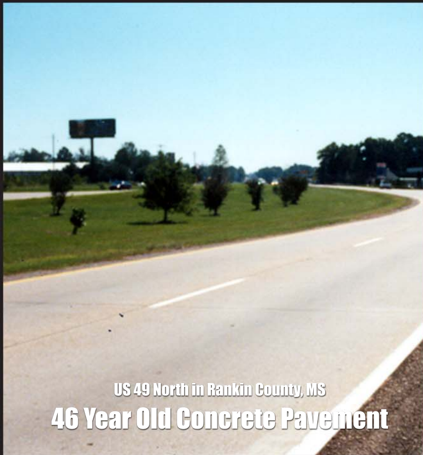
US 49 North in Rankin County, MS 46 Year Old Concrete Pavement