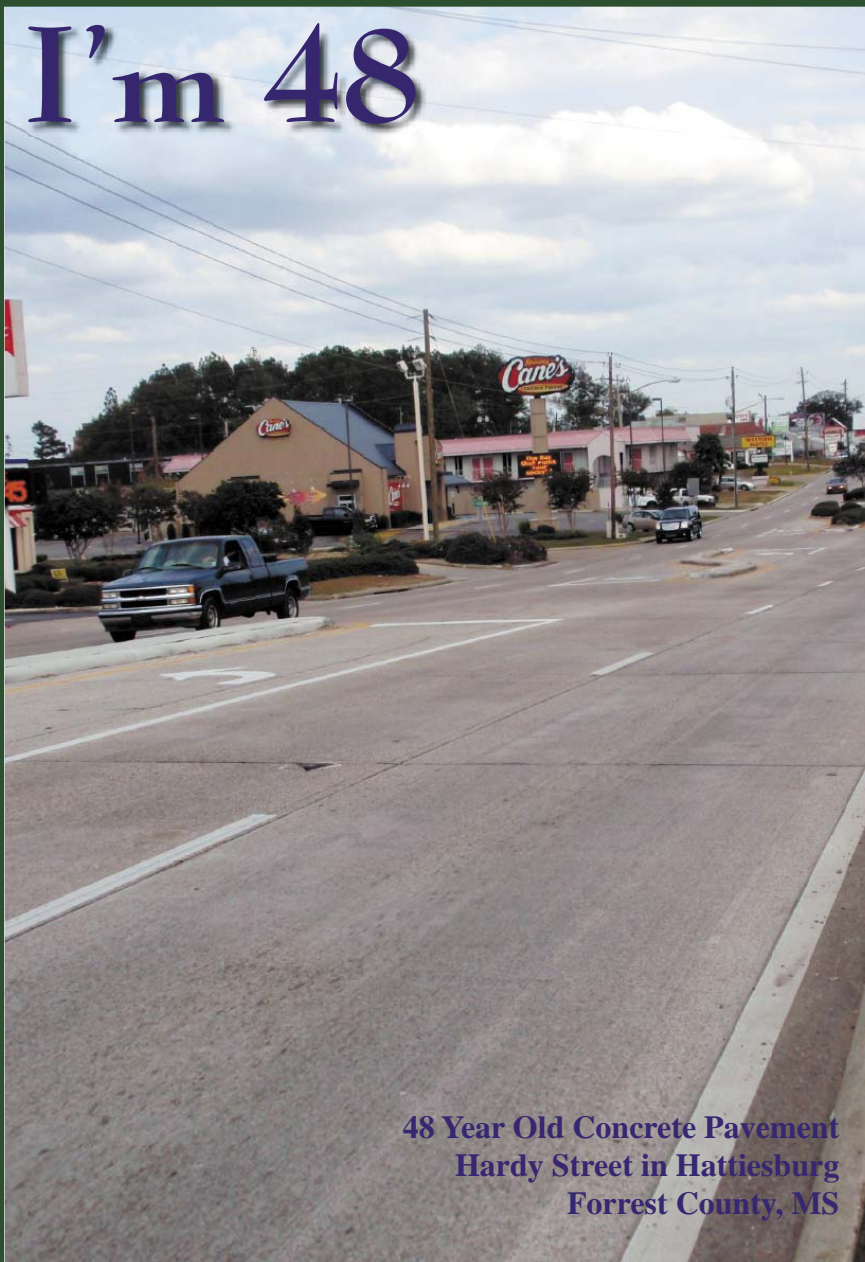
48 Year Old Concrete Pavement Hardy Street in Hattiesburg Forrest County, MS